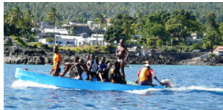
Field trip: Overview of agriculture and fishing in Comoros.

The project has also sought to overcome the isolation of Madagascar and Comoros by increasing scientific knowledge exchanges within the partnership, by strengthening the linkages with the local Ministries of Education and by establishing an international consortium for programme development, research, and staff-exchange in the field of food security and sustainable agriculture. This included the development of an e-learning system.