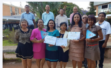
Delivery of certificates to part of the trained administrative staff (ENS).