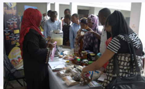
Informative measures on processed local food during project visibility activity at Comoros.